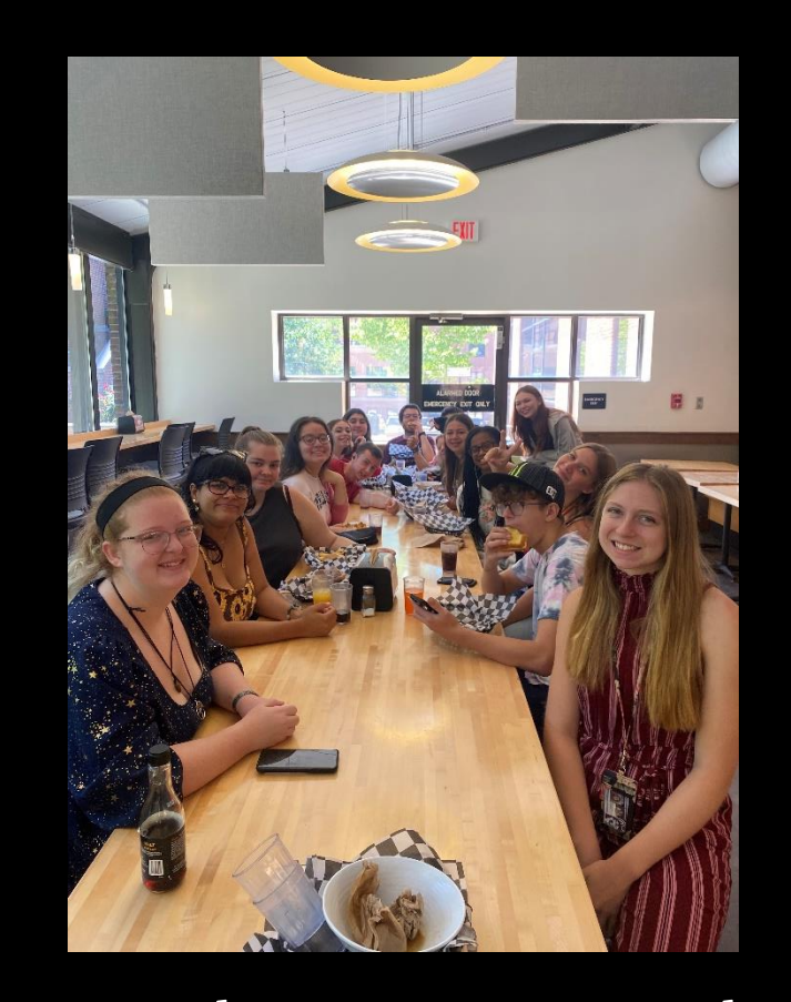
UB students are encouraged to complete <u>at least one</u> Summer Academy before graduating from high school.