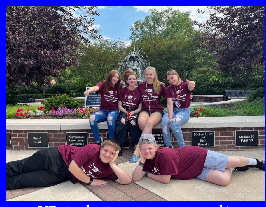
UB students are encouraged to complete at least one Summer Academy before graduating from high school.