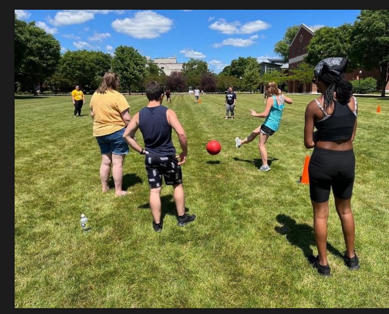
UB students are encouraged to complete at least one Summer Academy before graduating from high school.