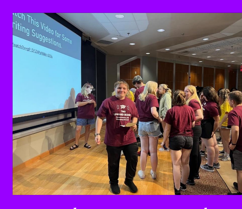
UB students are encouraged to complete at least one Summer Academy before graduating from high school.